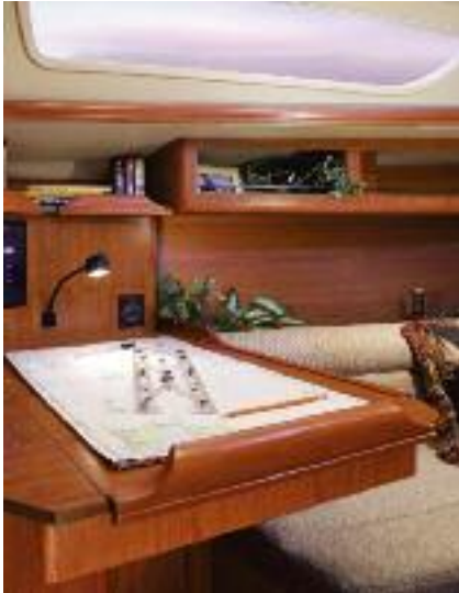
The navigation station offers a good work space and easy access to radios and electrical panels.

cedar-lined hanging locker to port. Aft, the private cabin also provides more than enough space and comfort.