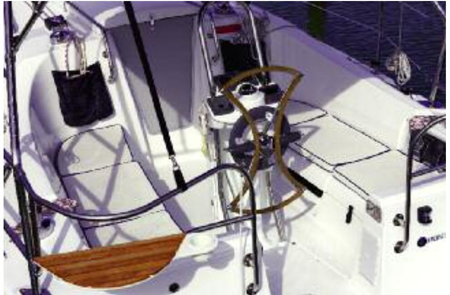
The cockpit boasts a wide open space, perfect for any family and/or couples cruising on the weekend.

Below the interior is wonderful. Neat aspects include a nice wide entry, easy