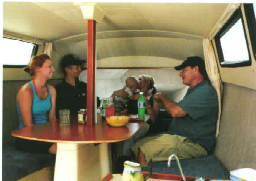
Below the boat was large and functional with impressive headroom. The interior is well done with a nice touch of wood warming it up and making the boat feel bigger.

The boat can be easily accessorized with a bimini, cockpit table and the like. A roller furling system, sail cover and stern rail seats are where we would start, followed by a masthead wind indicator, a portable stove, and probably a second