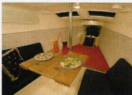
The convenient teak dining table adds a welcome touch of warmth to the bright, white cabin.

For a boat this size a lot of thought has gone into the sail plan. The boat comes with an easy mast raising system, perfect for trailering and touring on some canal systems. The boat is stable and tracks well under most