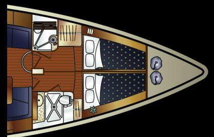
Three Stateroom Version